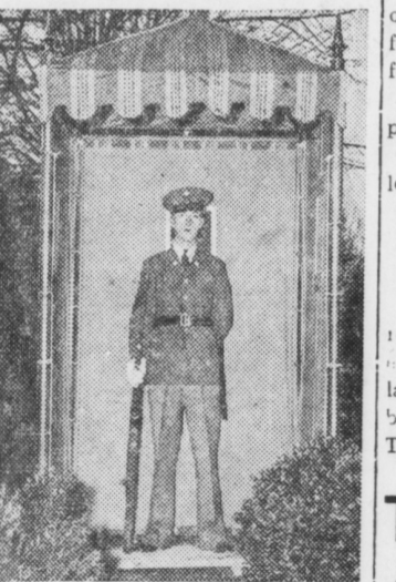
3 During bad weather guards use the sentry box instead of marching back and forth before the tomb. At all other times regulations provide that sentries shall stand guard outside.