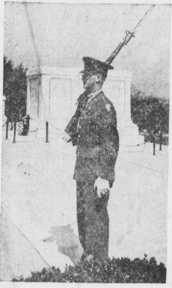
1 On guard at all times is one soldier. The sentry detail includes three shifts of four men each. Each shift is on duty 12 hours, then is off duty 24. This sentry marches 30 paces a minute, keeps the post for two hours, then is relieved for four.

ONCE a year—on Memorial Day—eyes of the nation focus on a tomb in Arlington National Cemetery in Washington, D. C., on which is inscribed: "Here rests in honored glory an American soldier known but to God." That those soldiers who died in service of their country shall be constantly remembered, the United States Army maintains a perpetual vigil over the tomb of the Unknown Soldier.