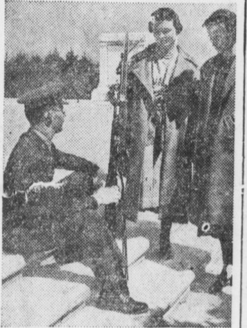
2 While waiting to go on duty, this private answers the questions of two sightseers. He and the 11 others of his detail will serve for 15 days, then be replaced by new sentries.