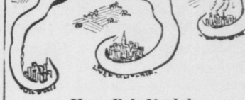
Home Rule Needed

"I am for Home Rule. The people, both farmers and city-dwellers, are best able to tell what they want