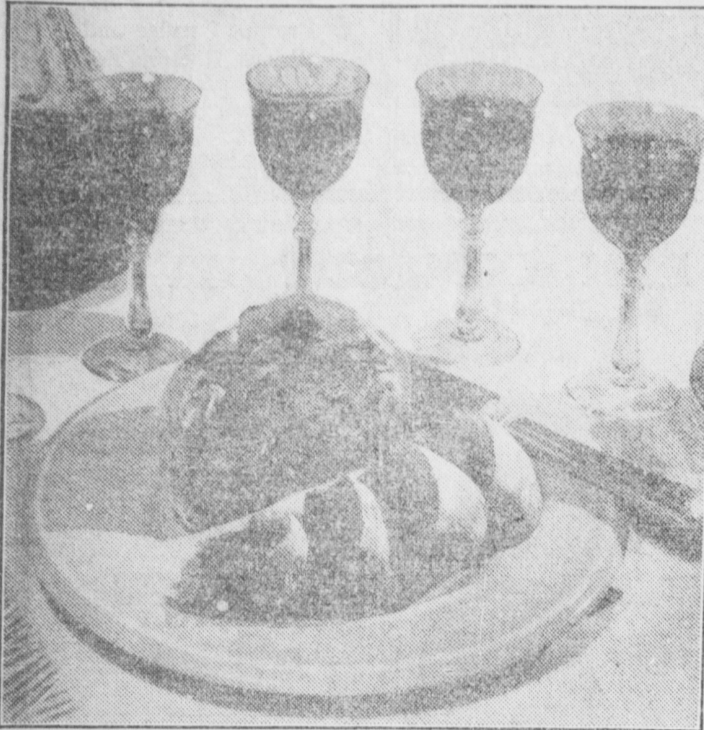
Fruit Cakes: Made in This Modern Manner Especially Attractive in Appearance and Delightfully Different in Flavor

THOSE who regularly send home-made gifts to their friends at Christmas time such as fruit cakes or plum puddings and have not yet heeded the slogan of "bake early" will be interested to learn about a new fruit cake recipe which can be made even a few weeks before Christmas and still be fully ripened.