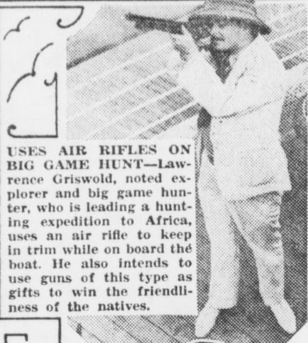
USES AIR RIFLES ON BIG GAME HUNT—Lawrence Griswold, noted explorer and big game hunter, who is leading a hunting expedition to Africa, uses an air rifle to keep in trim while on board the boat. He also intends to use guns of this type as gifts to win the friendliness of the natives.