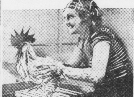
COCK-A-DOODLE DO GETS HIS SHAMPOO—Few people realize the great care taken by owners of prize poultry in order to ensure that their champion birds appear at their best on the show bench.