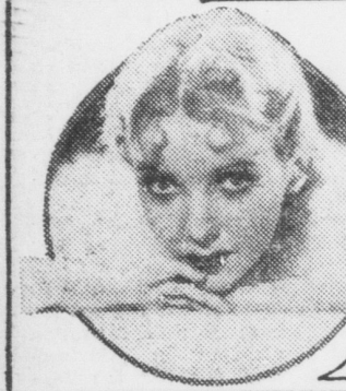
SCREEN STAR COMES OF 250 YEAR LINE OF ACTORS — Ida Lupino, youngest member of Britain's "royal family" of acting, has deserted British studios for Hollywood. She is the daughter of Stanley Lupino, London comedian, and niece of Lupino Lane and cousin of five other actors.