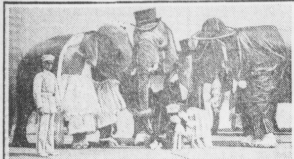
CIRCUS ELEPHANTS WED IN COLORFUL CEREMONY—With an entire block roped off for the occasion, Jumbo II, one of the few African elephants in captivity, was wedded to Burma Kangooona, a sprightly young Indian elephant at Los Angeles recently. Another large elephant enacted the role of minister.