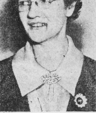
Judge Grace A. Miles

CHICAGO.—Appointment of four women to positions of importance in the Roosevelt administration was only a "smoke screen" to cover the discharge of hundreds of others under Section 213 of the National Econ-