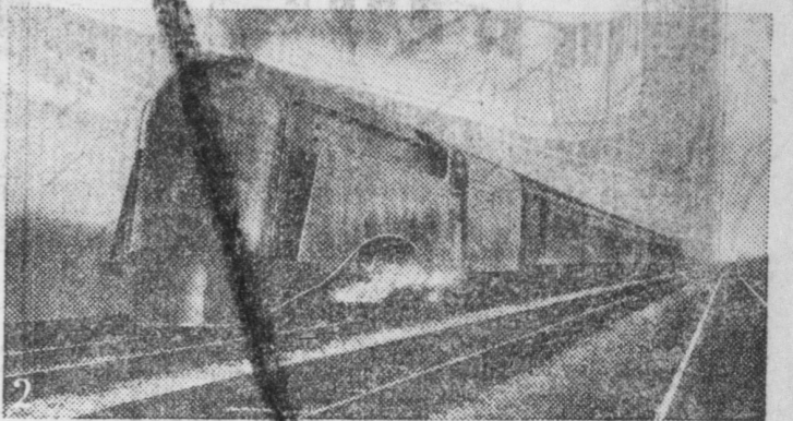
... The Twentieth Century Limited which is...