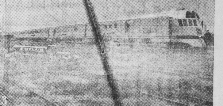
... one of the many famous trains on the 150 American railroads that use Sinclair Lubricants or Fuels...