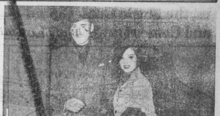
Lili Damita and Errol Flynn, star of the Warner Brothers picture, "Captain Blood", arrive in New York on...

You can get all the news of this locality for less than three cents a week through The Bulletin.