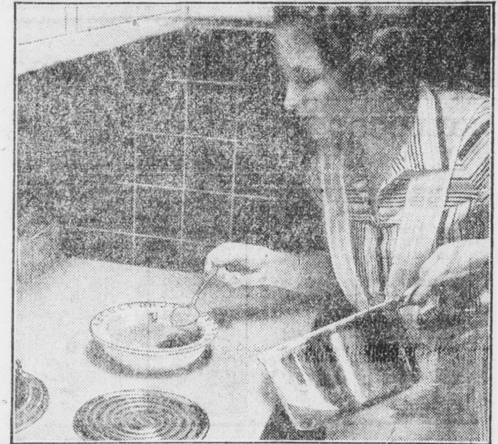
Cereals for children may be cooked thoroughly, with little trouble, on the surface unit of the modern electric range

saucepan, in a small amount of water, right on top the range without any of the usual dire burning consequences. The measured heat of the Calrod units is accurately controllable; it is also evenly distributed over the bottom of the saucepan. This fact insures uniform cooking and an easy-to-wash cereal pan; and, providing only