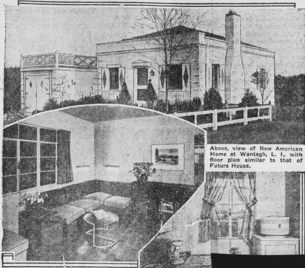
Above, view of New American Home at Wantagh, L. I., with floor plan similar to that of Future House.

Ten Thousand Visitors to New American Home in Rockefeller Center Applaud Time-Saving Devices