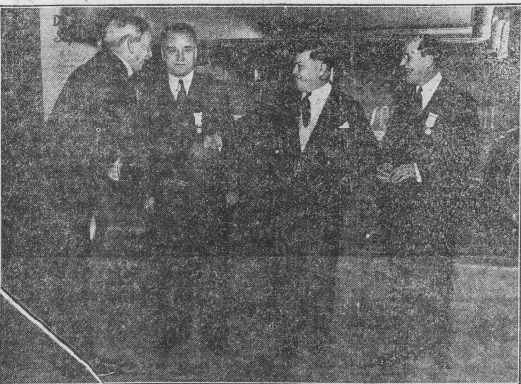
Pointing out that automobile manufacturers are putting every possible safety device into their cars, speakers at the 24th annual Safety Congress in Louisville stressed the necessity for sane driving in cutting down the accident rate.