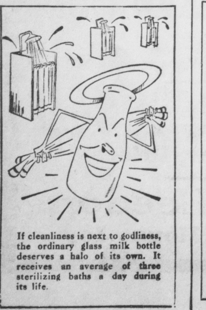
If cleanliness is next to godliness, the ordinary glass milk bottle deserves a halo of its own. It receives an average of three sterilizing baths a day during its life.