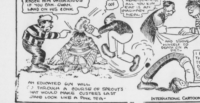
INTERNATIONAL CARTOON CO., N.Y. 116