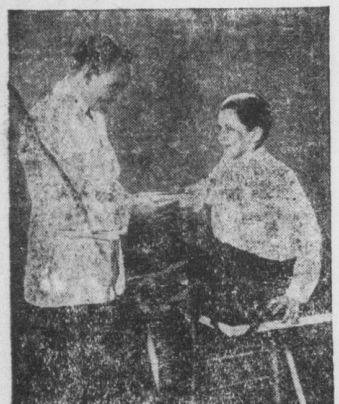
No matter how much the budget is cut, children must not suffer. This little boy is being protected against tuberculosis by having a tuberculin test.