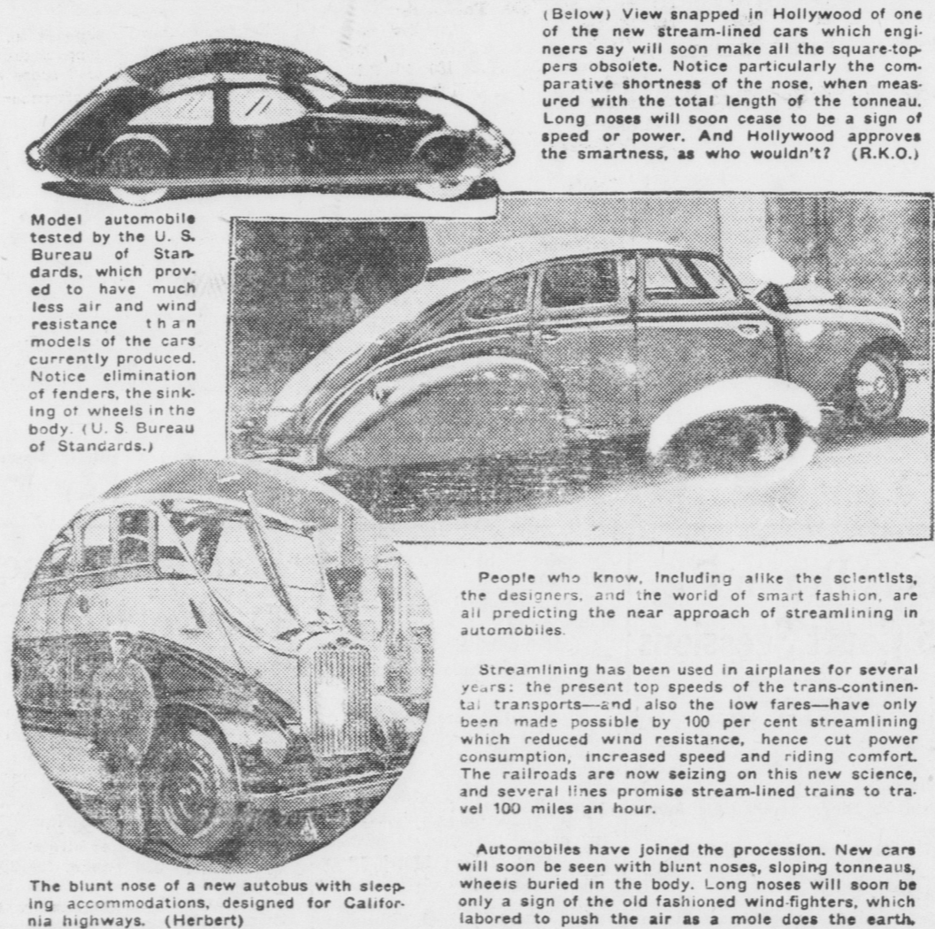
(Below) View snapped in Hollywood of one of the new stream-lined cars which engineers say will soon make all the square-toppers obsolete. Notice particularly the comparative shortness of the nose, when measured with the total length of the tonneau. Long noses will soon cease to be a sign of speed or power. And Hollywood approves the smartness, as who wouldn't? (R.K.O.)

Model automobile tested by the U. S. Bureau of Standards, which proved to have much less air and wind resistance than a model of the cars currently produced. Notice elimination of fenders, the sinking of wheels in the body (U. S. Bureau of Standards).