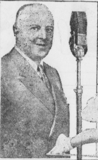
INTERROGATOR, Walter Trumbull, noted journalist who as a representative of the Average American Citizen...