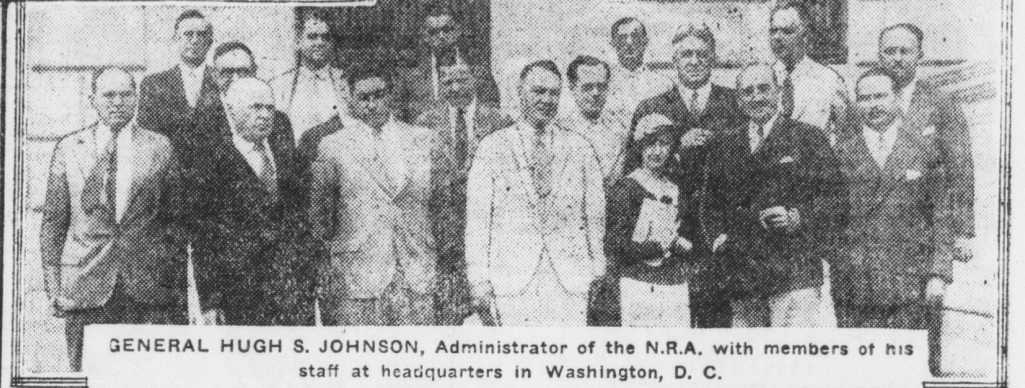
GENERAL HUGH S. JOHNSON, Administrator of the N.R.A., with members of his staff at headquarters in Washington, D. C.