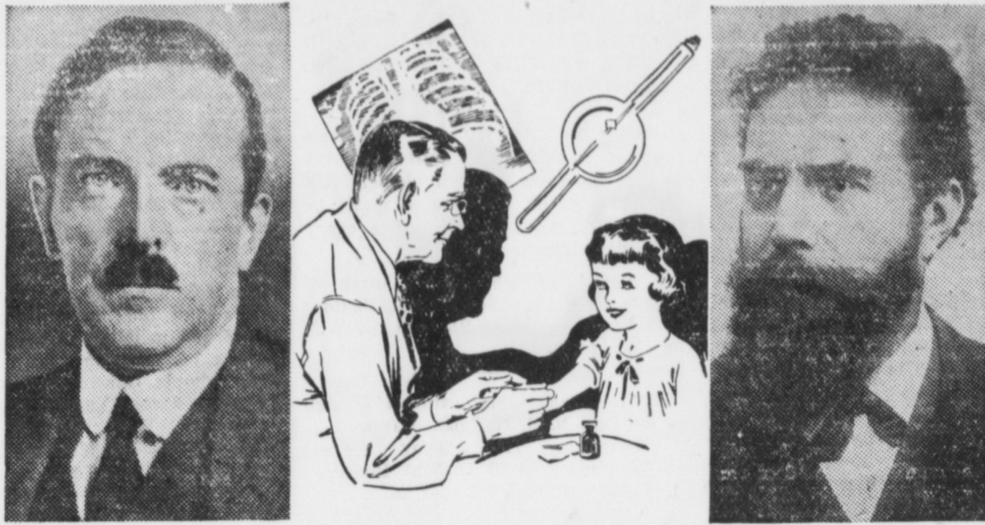
Dr. Clemens Pirquet, famous Viennese children's specialist (left) and Dr. Wilhelm Konrad Roentgen, German physicist, whose contributions to medical science have saved thousands of children from tuberculosis. Dr. Pirquet devised the tuberculin test and Dr. Roentgen discovered the X-ray.