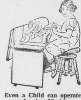
Even a Child can operate an Ironing Machine

An Ironer will do ALL your ironing... from large sheets and bed spreads to dainty handkerchiefs... and from heavy suits to flimsy negligees. The Ironer will do a better and a quicker job than you can do by hand. And it's so simple a machine that even a child can do the ironing.