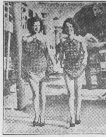
SOMETHING TO SNEEZE ABOUT IN ECONOMY