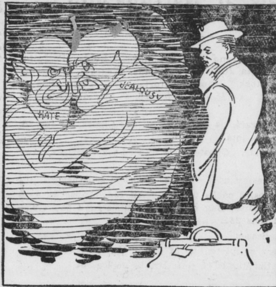
1. In Europe on an official mission in 1914, Hoover was alarmed at the international hatreds that he saw.