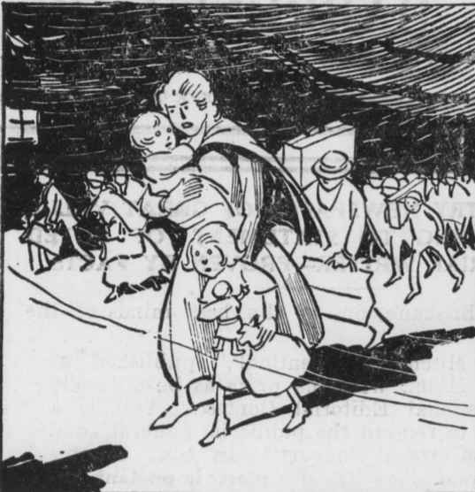
3. Then arose the call of the refugees. Hoover stepped into the breach to handle this relief operation.