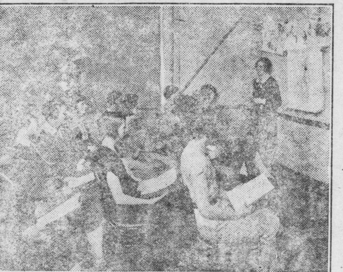
A class of young women receiving instruction on keeping fit in the general health course.