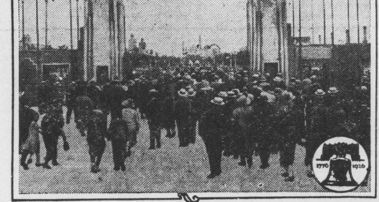
This picture is typical of many such scenes enacted daily at the main gates of the Sesqui-Centennial International Exposition in Philadelphia where the 150th anniversary of the signing of the Declaration of Independence is being celebrated. The "shot" was made from outside the gates and shows the long sweep of historic Broad street, the main artery of the exposition. To the left can be seen one of the capstons of the Palace of Liberal Arts and Manufactures which covers nearly eight acres of grounds and which houses some of the finest exhibits ever seen. The Exposition will continue until December 1.