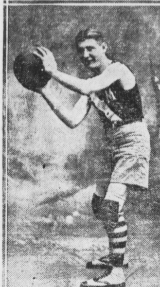
MOUNT JOY LOST THE OPENING GAME OF THE SEASON—RESERVES EASILY DEFEAT ROTHSVILLE P. O. S. OF A.

If you do not get your share of the business in this vicinity, it's your own fault—no one else's. Advertise and tell the people what you have to sell.