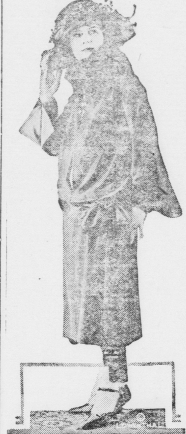
This handsome new fall creation for street wear is made of navy poret. The collar, cuffs and belt are trimmed with caracul fur, side panel and saah trimmed with cut steel cabochons.