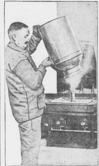
Sterilizing Dairy Utensils is an Important Factor in Keeping Milk Sweet.

The milk can has the same relation to the wholesale trade as the milk bottle has to the retail trade, and it is just as important that it be washed immediately after being emptied, says the United States Department of Agriculture. Milk dealers have appliances for washing and sterilizing the cans, but this does not excuse the buyer from rinsing them before they