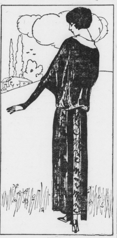
Dress Showing New Cape-Back.

On many models of georgette and chiffon fine plaitings replace tucks as trimming. So fine are these plaits that at a distance the effect is that of cording. White chalk beads worked into fanciful designs are the means of ornamenting models of white silk or chiffon. A very unique trimming