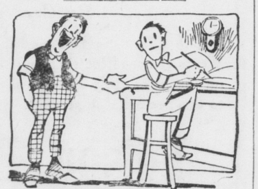
LONG AND SHORT OF IT.

Here is a dog story that is said to have happened a few weeks ago in Pickering, Ont. A family has two dogs, Jack, a large one, and Jill, a little one. Someone left the back gate open, and the dogs got out. Dogs are not allowed to run on the streets in Pickering. The family anxiously hunted for them, but could not find them. An hour or two later, Jack came trotting up the street carrying Jill in his mouth by the nape of the neck, as cats carry their kittens. Jill was yelping and kicking and trying to get away, but Jack held on until he had got her safely home, and the gate shut. Evidently Jill had been having a good time.