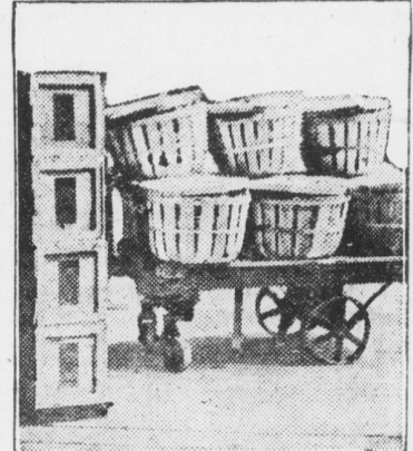
Peaches in Baskets and Boxes Ready for Shipment.

Where Grades Are Adopted. According to recent reports, the . United States grades will be adopted this season by the Sand Hill Fruit and the Western New York Fruit Grov