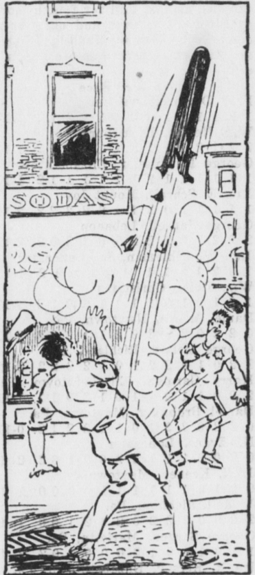
Twisting, Whirling and Shooting Upwards.

At precisely that moment Policeman Finger's words were drowned in an