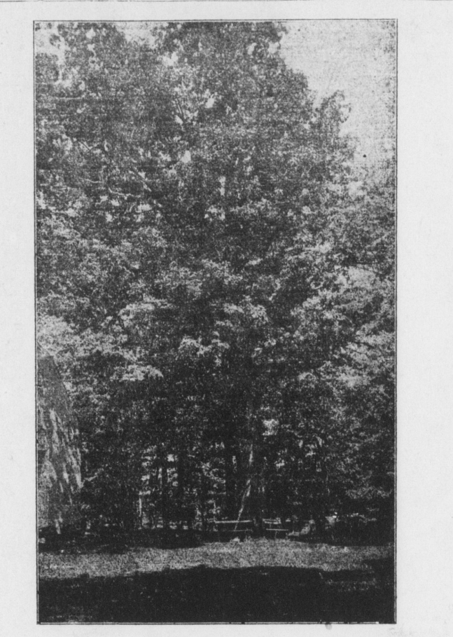
WITNESS TREE, AT DONEGAL SPRINGS

BORO COUNCIL HELD TWO WITNESS TREE IS 144 YEARS OLD