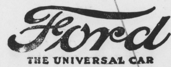
THE UNIVERSAL CAR

GARBERS' GARAGE ELIZABETHTOWN, PA. Ind. Phone 605A.