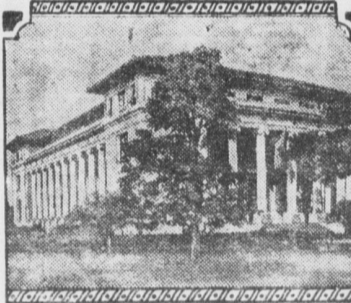
University of the Philippines which has an enrollment of 3,500 students.

"The Filipino boys and girls are well balanced, docile and industrious