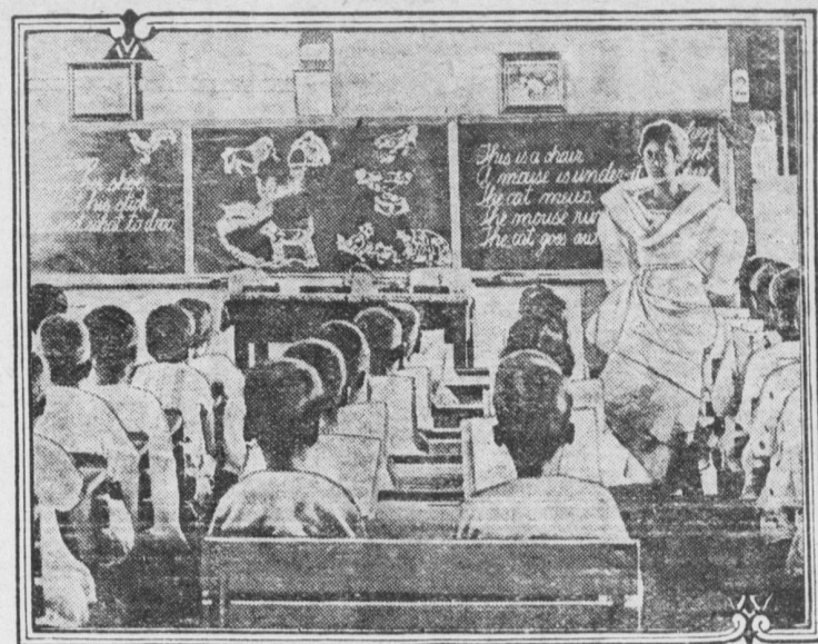
This is the type of schoolroom that is rapidly making an English speaking nation out of the 10,500,000 inhabitants of the Philippines.

If a teacher in a public school in the Philippines desires to punish a child, she doesn't have to apply the ruler. She simply sentences the offending pupil to remain away from school a few days!