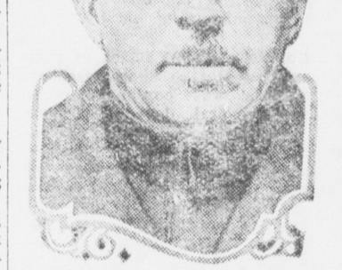
MAJ. GEN. LEONARD WOOD