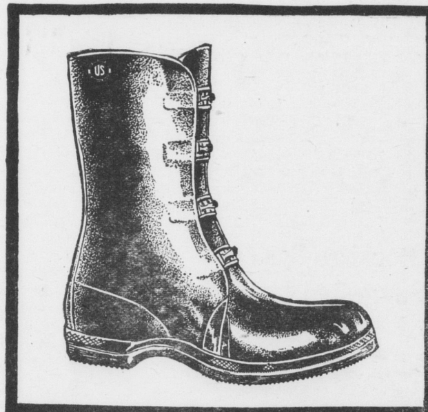
Warm—watertight—cleaned in a minute: that's the "U.S." Walrus. It's just one model in the big U. S. line of rubber footwear