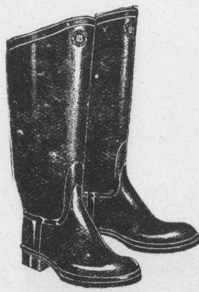
"U.S." Boots—made in all sizes and styles—Hip, Half-Hip and Knee. In red, black and white

Ask your dealer to show you the U. S. Walrus. After you've worn them you'll