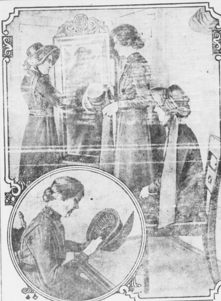
TRIMMING A BONNET