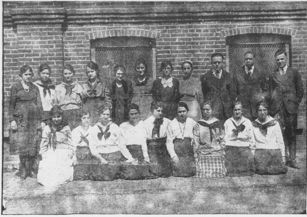
Mount Joy High School Graduating Class 1920