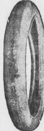
AS WE RECEIVE IT

WE can save you money on your tire expense each year—and enough to make it worth while, too.