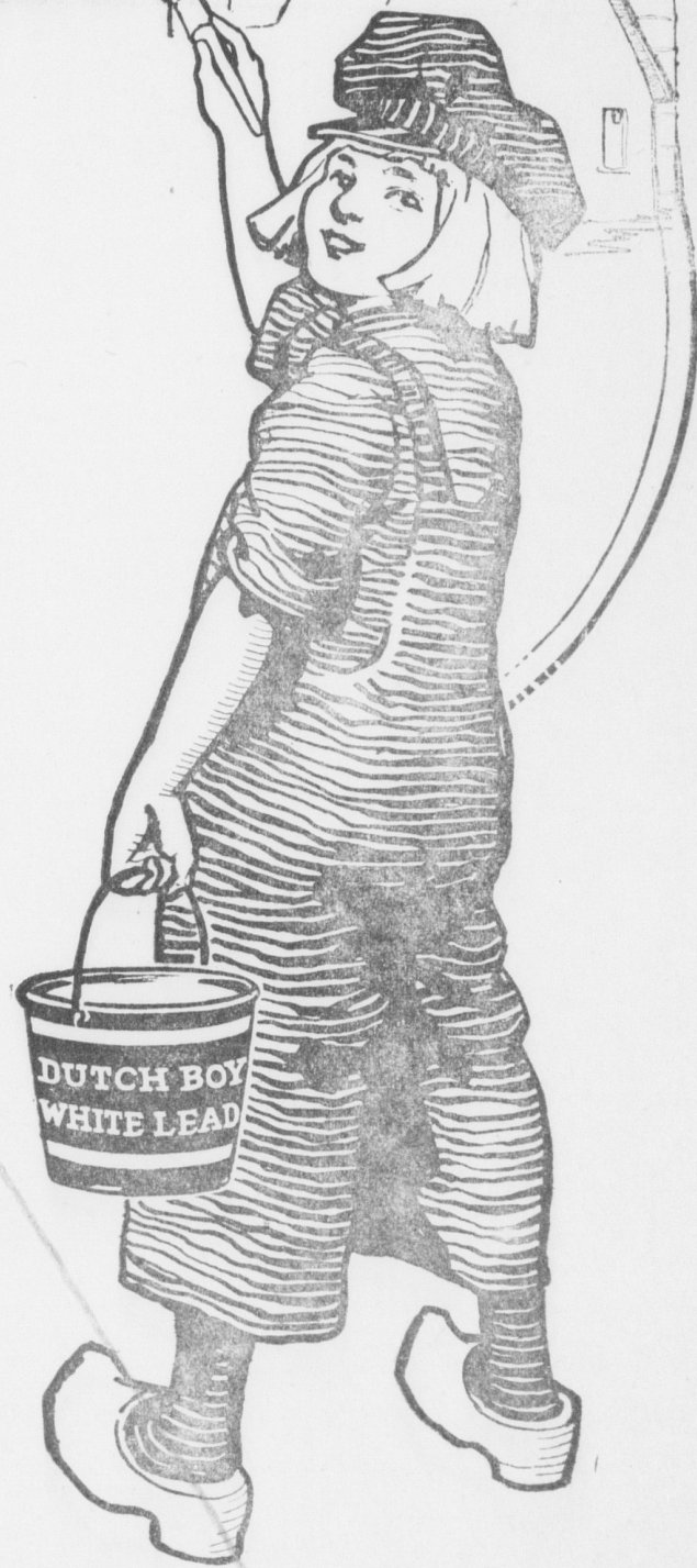
Save the surface and you save all; to save the surface, white-lead it.