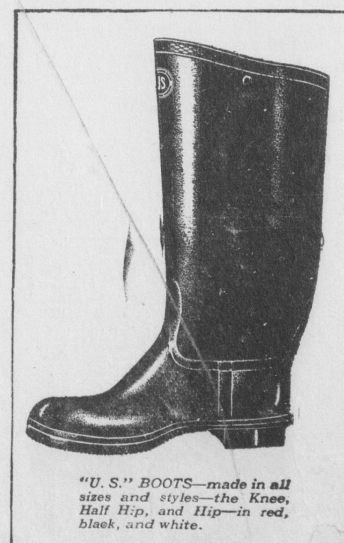
"U. S." BOOTEES—made in all sizes and styles—the Knee, Half Hip, and Hip—in red, black, and white.