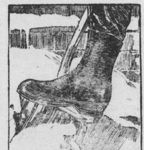
"U.S." Arctics—Made of snow-tight cashmere, warm and comfortable. Reinforced where the wear is hardest. In one, two, four and six buckles, all weights and sizes.

Ask for U. S. Rubber footwear—it means solid wear and long service for your money.