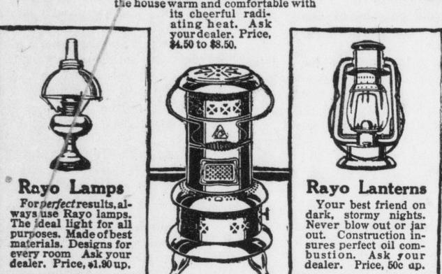
Rayo Lamps For perfect results, always use Rayo lamps... Rayo Lanterns Your best friend on dark, stormy nights...