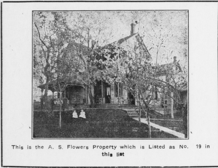
This is the A. S. Flowers Property which is listed as No. 19 in this list