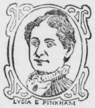
LYDIA E. PINKHAM

E. PINKHAM'S Vegetable Compound answered my questions.