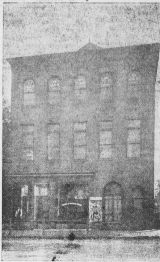
MOUNT JOY HALL Where Reunion was held