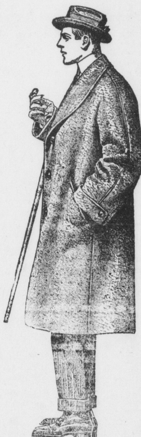
Copyright 1912 The House of Kuppenheimer

Another lot of those remarkable Overcoats everybody is talking about. A fall weight top coat; full silk lined to edge of lapels; fine black thibet material; very handsomely finished; you can't find its equal for less than $15; our price is $10