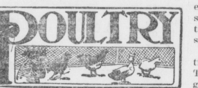
MANY FAVOR TOULOUSE GEESE

More Compact in Shape Than Other Breeds and Gender Will Weigh About Twenty Pounds.