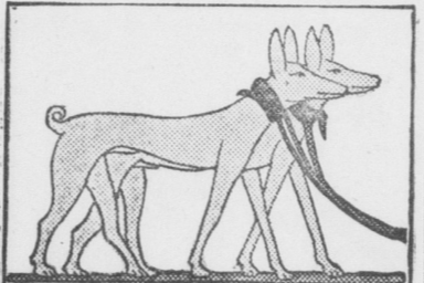
Ancient Egyptian Greyhound or Zouglu.

London.—The rush to Europe season is at hand, and visiting Americans and others fond of all the animals and birds on earth are advised to visit the South Kensington museum, which is the natural history branch of the British museum, London. The Kensington building is an enormous place and only a two penny fare from Charing Cross—virtually the center of the metropolis. The collection of everything with legs and wings is nothing short of wonderful. In an ordinary zoological collection many of the most interesting creatures are asleep or otherwise behind the scenes. At South Kensington, however, every dead beast and bird is very much "alive," and one can