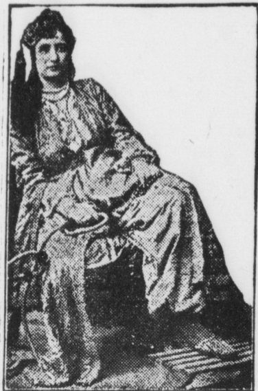
In Bridal Attire.

Paris, France.—There is nothing else in the world quite like the little "protected republic" of Andorra, a veritable Rip Van Winkle land, hardly yet stirring from its thousand years' slumber.