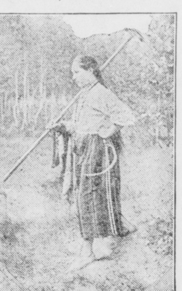
Typical Kabyle Woman.

They are fond of cold steel, are these Kabyles, for at the conclusion of a wedding ceremony the bridegroom, walking backward, holds aloft a naked dagger, and the bride, following him, keeps the point of it between her teeth. Another marriage custom of Kabylia, even more barbaric, consists in the part martyrdom of the bride, who, clad in her wed-