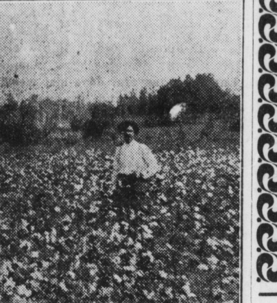
A Cotton Field in Mississippi.

Plants use an enormous quantity of water. An acre of good corn will absorb and evaporate during its growth nearly ten inches of water. About three-fourths of this amount will be required the last 75 days of its growth, or at the rate of three inches of water a month. This is in addition to evaporation from the soil, which, even with