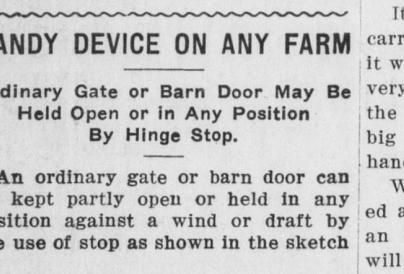
Hinge Stop for Barn Door.

An ordinary gate or barn door can be kept partly open or held in any position against a wind or draft by the use of stop as shown in the sketch