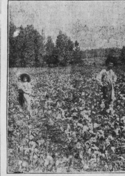
A Cotton Field in Mississippi.

The presence of heat, air and moisture is essential to chemical and germ action in the preparation of plant food in the soil. The depths to which these