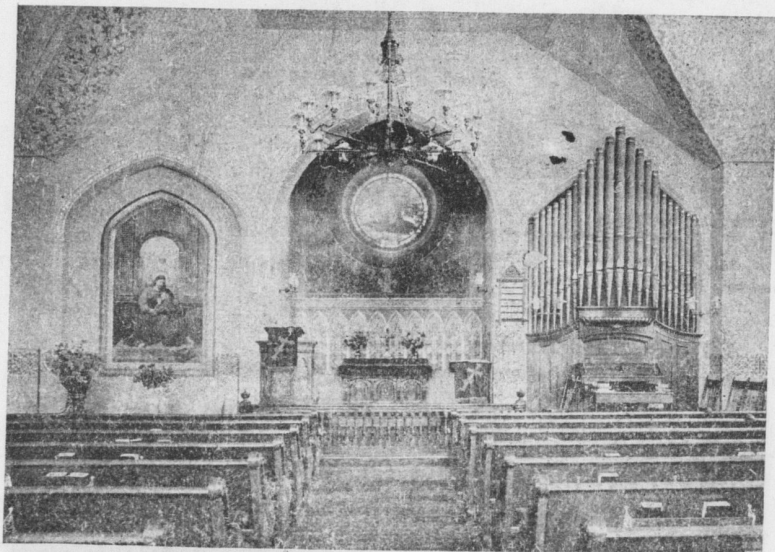
Interior of Lutheran Church, Mount Joy, Pa.