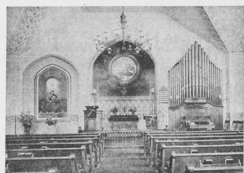
Interior of Lutheran Church, Mount Joy, Pa