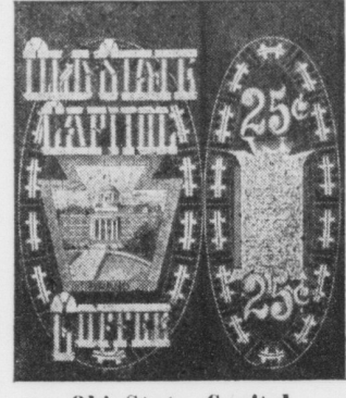
Old State Capitol