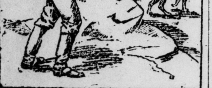
SPORT IN ARIZONA. (Hunting Expedition to Exterminate Mountain Lions.)

At one time the California lion was to be found in all parts of Arizona, but large territorial and